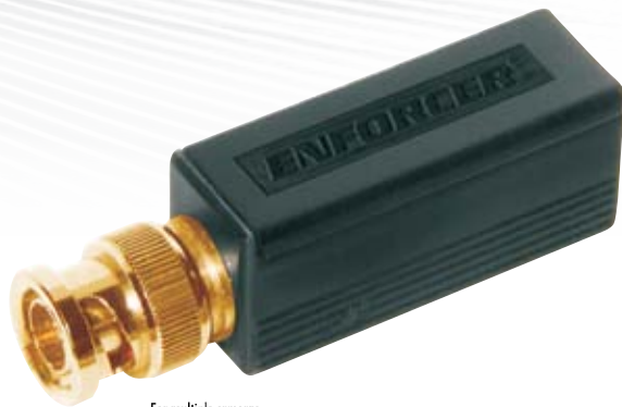
For multiple cameras: